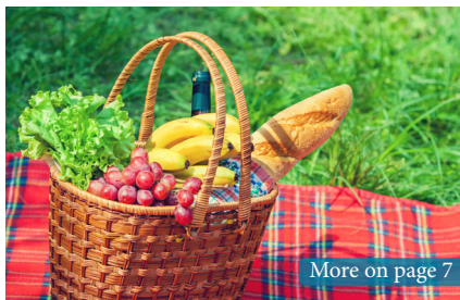
More on page 7