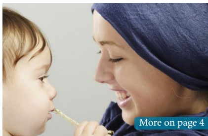
More on page 4